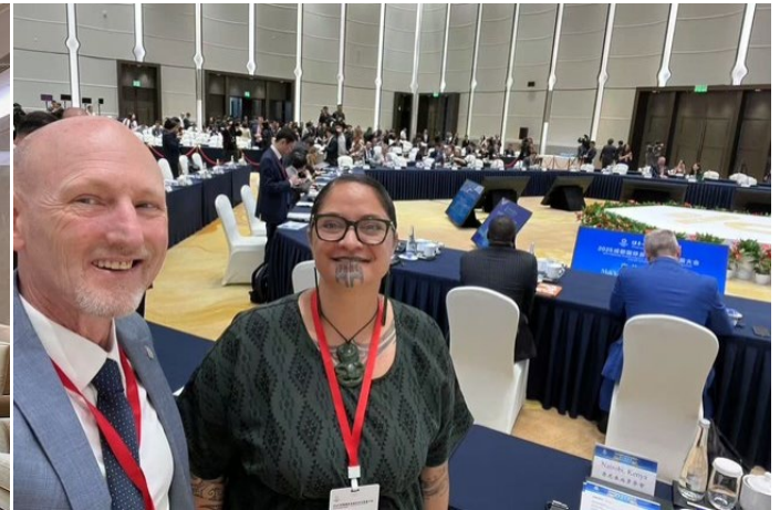
Start of the conference