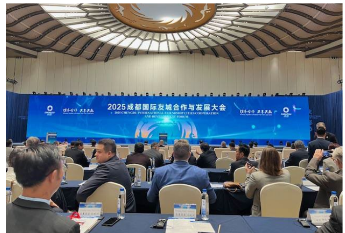
Start of the conference