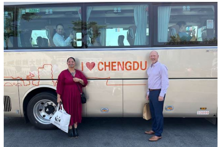
Chengdu Field Trip