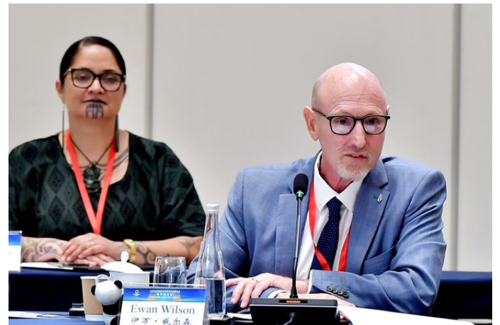
Round table discussion