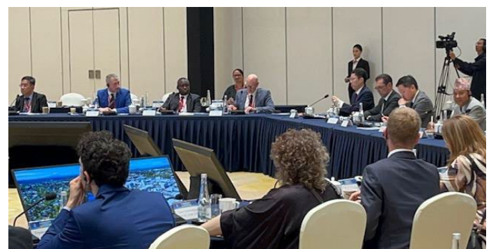
Round table discussion