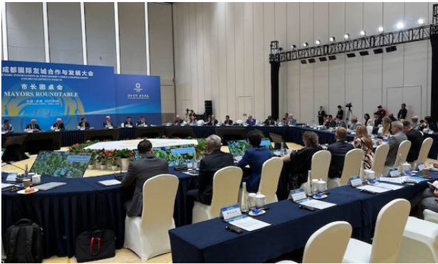
Round table discussion