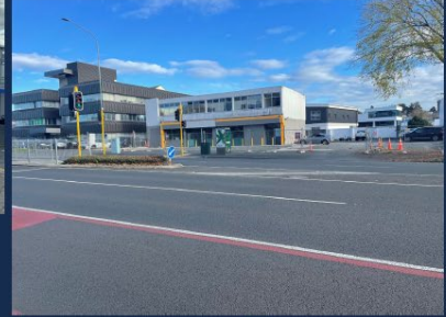
121 Anglesea St