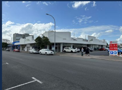
City Fitness, 308 Barton St