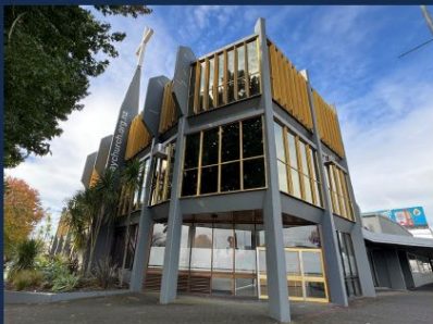
McDonalds, 950 Victoria St