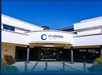
19 Knox St