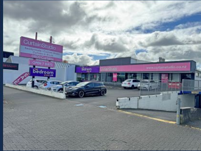
856 Victoria St