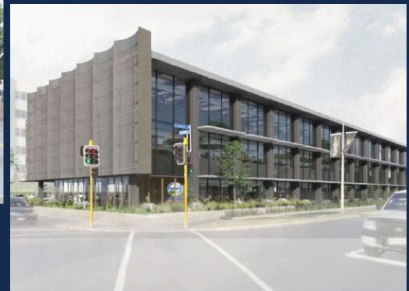
Fonterra North Block