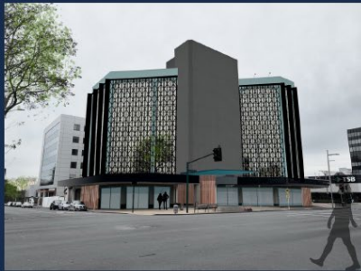
500 Victoria Street