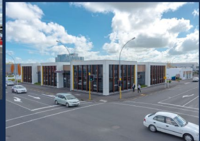
BP Software, 520 Anglesea St