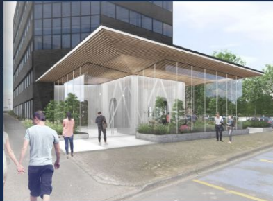
18 London Street