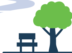
Parks and open spaces